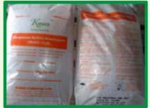
\text{MnSO}_4 \cdot \text{H}_2\text{O} (Manganese Sulphate)