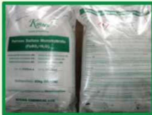
\text{FeSO}_4 \cdot \text{H}_2\text{O} (Iron Sulphate)