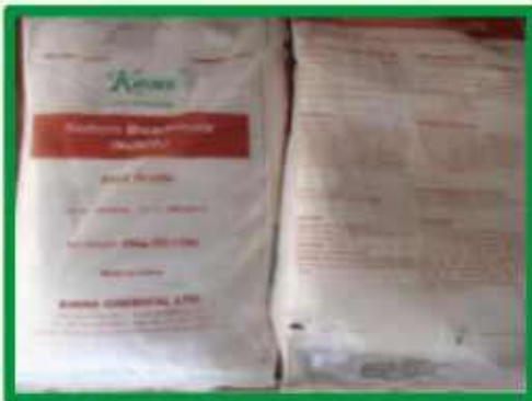
\text{NaHCO}_3 (Sodium Bicarbonate)