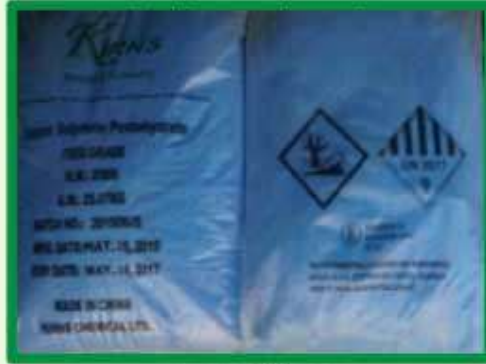
\text{CuSO}_4 \cdot 5\text{H}_2\text{O} (Copper sulphate)