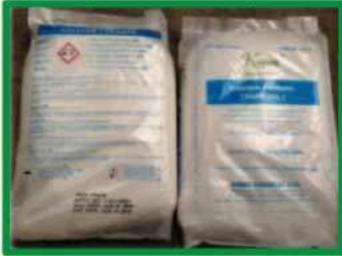
\text{Ca}(\text{HCOO})_2 (Calcium Formate)